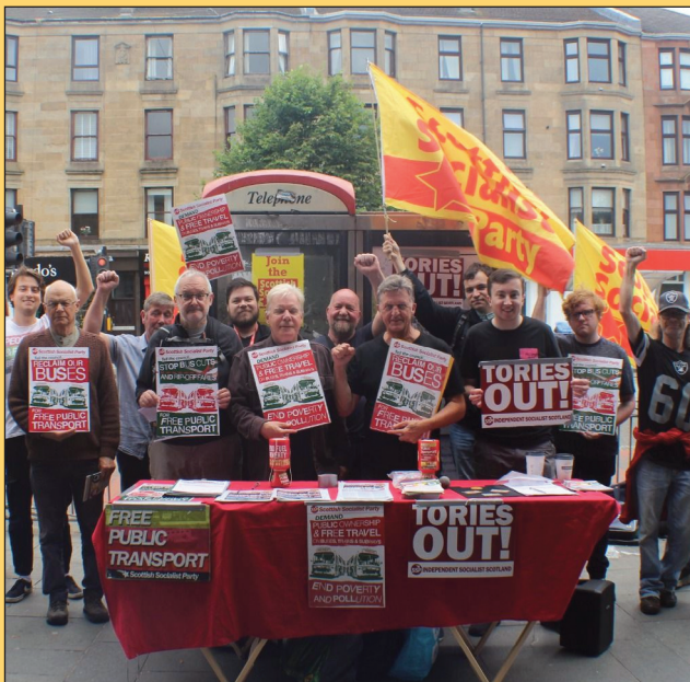
SSP: the Scottish Socialists stand for free public transport, to tackle poverty, inequality, social isolation and car pollution

heating bills, cut emissions, create thousands of jobs